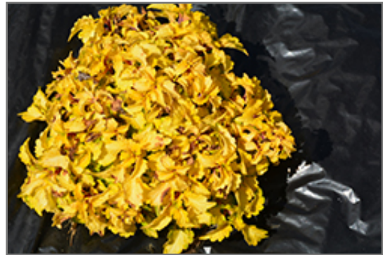
Wildfire Flicker Coleus