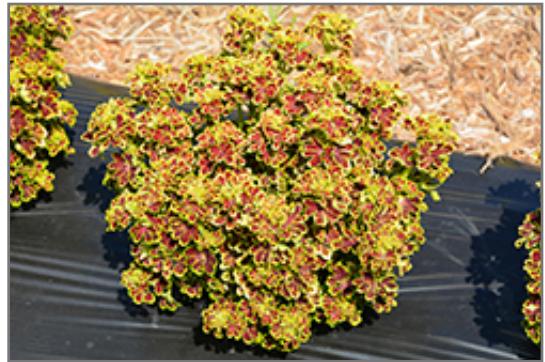
Tidbits Tammy Coleus