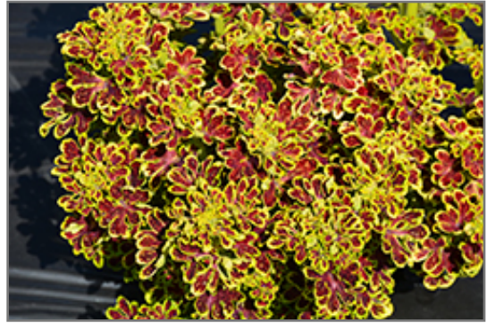
Tidbits Tammy Coleus foliage

Tidbits Tammy Coleus is recommended for the following landscape applications;