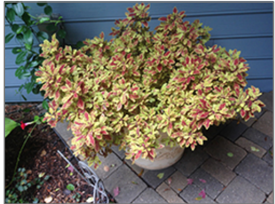
Terra Nova Marrakesh Coleus