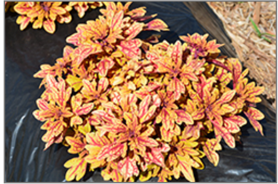
Terra Nova Marrakesh Coleus

Terra Nova Marrakesh Coleus is recommended for the following landscape applications;