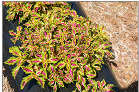
Terra Nova Jitters Coleus