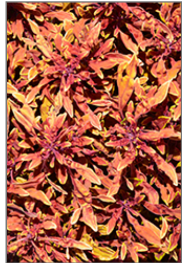
Hipsters Jasper Coleus foliage

Hipsters Jasper Coleus is recommended for the following landscape applications;