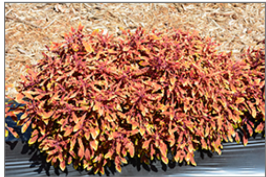
Hipsters Jasper Coleus