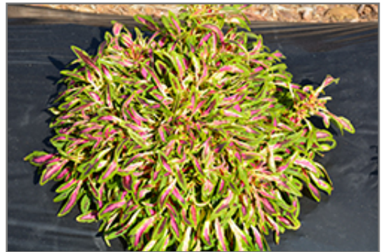
Fancy Feathers Pink Coleus