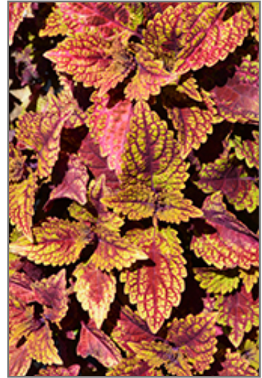
Color Clouds Spicy Coleus foliage

Color Clouds Spicy Coleus is recommended for the following landscape applications;