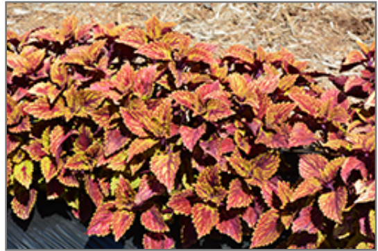
Color Clouds Spicy Coleus