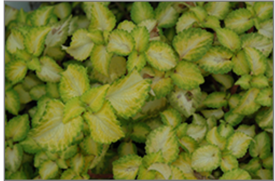
Terra Nova Electric Slide Coleus foliage