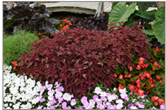
ColorBlaze Velveteen Coleus