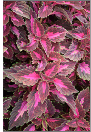
ColorBlaze Velveteen Coleus foliage

ColorBlaze Velveteen Coleus is recommended for the following landscape applications;