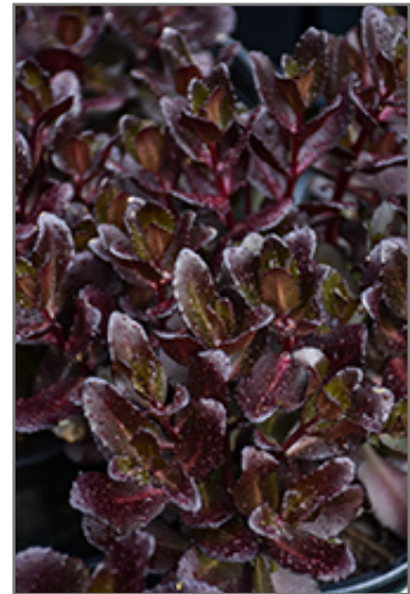
Touchdown Teak Stonecrop foliage

Touchdown Teak Stonecrop is a fine choice for the garden, but it is also a good selection for planting in outdoor pots and containers. With its upright habit of growth, it is best suited for use as a 'thriller' in the 'spiller-thriller-filler' container combination; plant it near the center of the pot, surrounded by smaller plants and those that spill over the edges. Note that when growing plants in outdoor containers and baskets, they may require more frequent waterings than they would in the yard or garden.