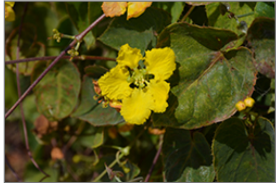
Orchid Vine flowers