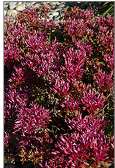
Dragon's Blood Stonecrop in bloom

Dragon's Blood Stonecrop is a fine choice for the garden, but it is also a good selection for planting in outdoor pots and containers. Because of its spreading habit of growth, it is ideally suited for use as a 'spiller' in the 'spiller-thriller-filler' container combination; plant it near the edges where it can spill gracefully over the pot. Note that when growing plants in outdoor containers and baskets, they may require more frequent waterings than they would in the yard or garden.