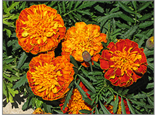
Petit Harmony Boy Marigold flowers