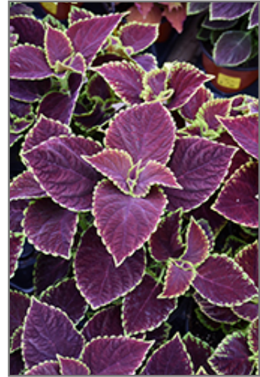
Premium Sun Chocolate Mint Coleus foliage

Premium Sun Chocolate Mint Coleus is recommended for the following landscape applications;