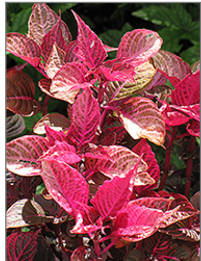
Linden's Blood Leaf foliage