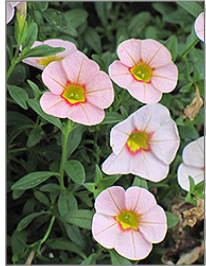
Superbells Pink Kiss Calibrachoa flowers