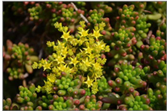
Jelly Bean Plant flowers