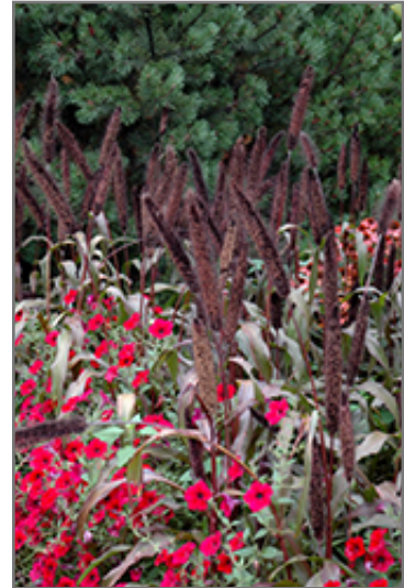
Purple Baron Millet in bloom

Purple Baron Millet is recommended for the following landscape applications;