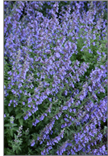
Cat's Meow Catmint flowers

Cat's Meow Catmint is recommended for the following landscape applications;