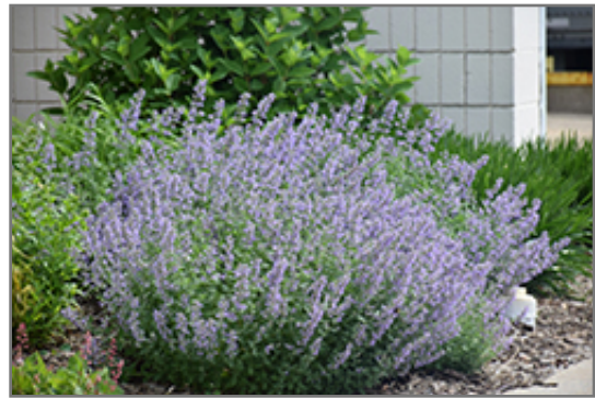
Cat's Meow Catmint in bloom