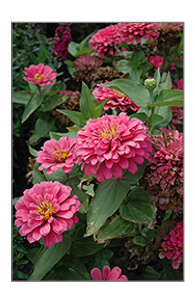
Champagne Toast Zinnia flowers

Champagne Toast Zinnia will grow to be about 16 inches tall at maturity, with a spread of 12 inches. When grown in masses or used as a bedding plant, individual plants should be spaced approximately 8 inches apart. Its foliage tends to remain dense right to the ground, not requiring facer plants in front. This fast-growing annual will normally live for one full growing season, needing replacement the following year.