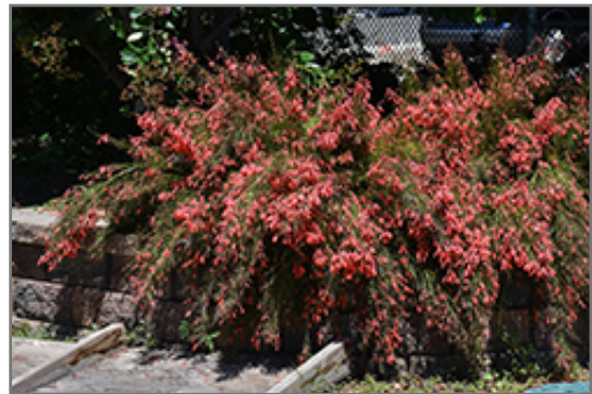
Firecracker Plant in bloom