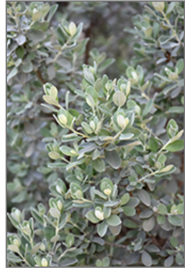
Texas Sage foliage

Texas Sage makes a fine choice for the outdoor landscape, but it is also well-suited for use in outdoor pots and containers. With its upright habit of growth, it is best suited for use as a 'thriller' in the 'spiller-thriller-filler' container combination; plant it near the center of the pot, surrounded by smaller plants and those that spill over the edges. It is even sizeable enough that it can be grown alone in a suitable container. Note that when grown in a container, it may not perform exactly as indicated on the tag - this is to be expected. Also note that when growing plants in outdoor containers and baskets, they may require more frequent waterings than they would in the yard or garden.