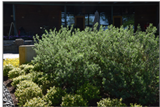
Texas Sage