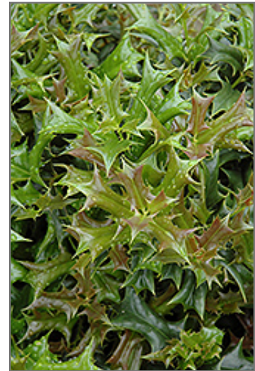
Rotunda Chinese Holly foliage