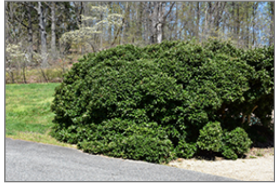
Rotunda Chinese Holly

Rotunda Chinese Holly is recommended for the following landscape applications;