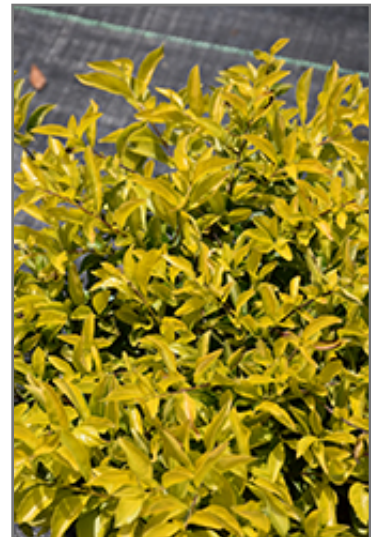
Gold Mound Duranta foliage