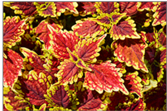
Oxford Street Coleus foliage