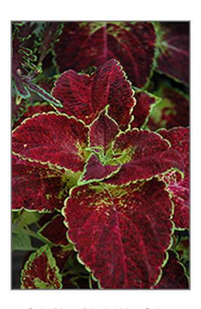
ColorBlaze Dipt in Wine Coleus foliage

ColorBlaze Dipt in Wine Coleus will grow to be about 24 inches tall at maturity, with a spread of 14 inches. When grown in masses or used as a bedding plant, individual plants should be spaced approximately 12 inches apart. It grows at a fast rate, and under ideal conditions can be expected to live for approximately 5 years. As an evegreen perennial, this plant will typically keep its form and foliage year-round.