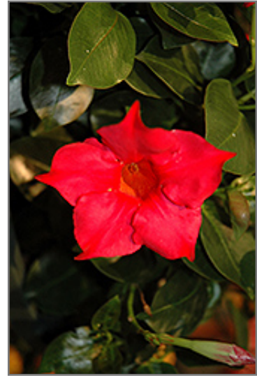
Rio Hot Pink Mandevilla flowers

A wonderful heat and drought tolerant selection boasting a mounded, compact habit, perfect for patio containers or hanging baskets; large, hot pink flowers over glossy green foliage; deadhead to encourage new blooms