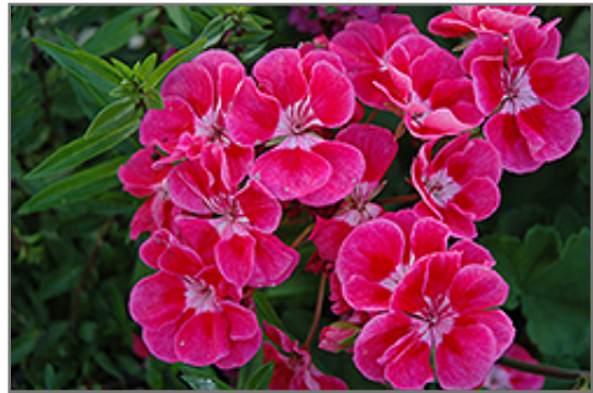
Fantasia Strawberry Sizzle Geranium flowers