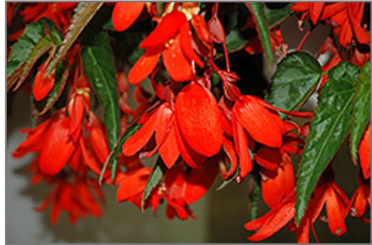
Waterfall Encanto Falls Begonia flowers

Waterfall Encanto Falls Begonia is recommended for the following landscape applications;