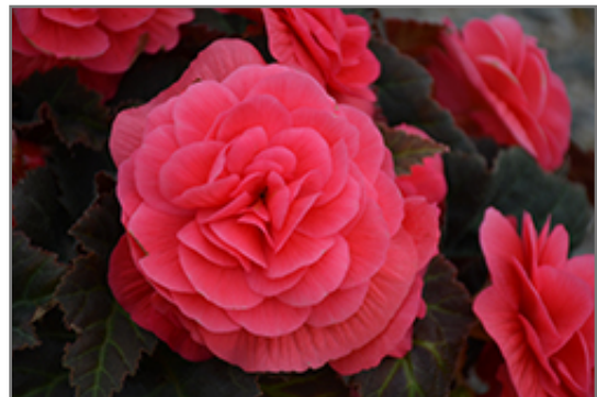
Nonstop Mocca Pink Shades Begonia flowers