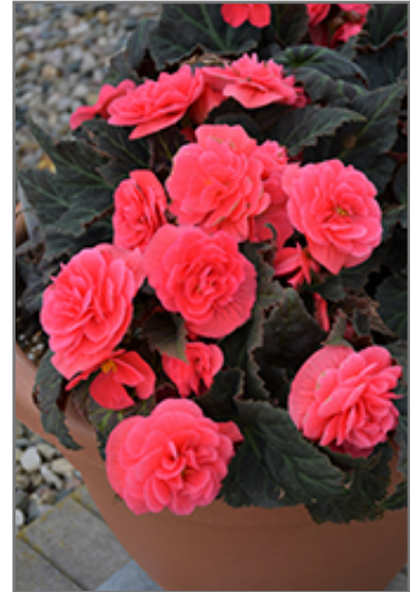
Nonstop Mocca Pink Shades Begonia in bloom