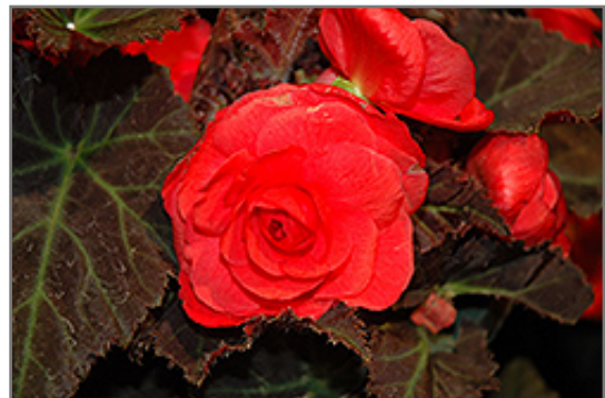
Nonstop Mocca Cherry Begonia flowers