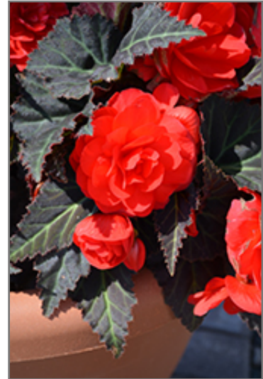
Nonstop Mocca Cherry Begonia flowers