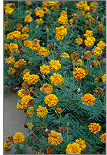
Zenith Orange and Red Marigold flowers

Zenith Orange and Red Marigold will grow to be about 14 inches tall at maturity, with a spread of 14 inches. When grown in masses or used as a bedding plant, individual plants should be spaced approximately 12 inches apart. Its foliage tends to remain dense right to the ground, not requiring facer plants in front. This fast-growing annual will normally live for one full growing season, needing replacement the following year.