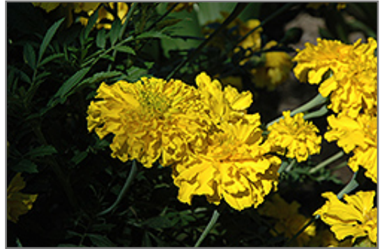
Babuda Gold Marigold flowers