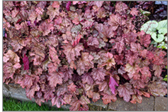
Carnival Watermelon Coral Bells in bloom

Carnival Watermelon Coral Bells will grow to be about 12 inches tall at maturity extending to 18 inches tall with the flowers, with a spread of 14 inches. When grown in masses or used as a bedding plant, individual plants should be spaced approximately 10 inches apart. Its foliage tends to remain dense right to the ground, not requiring facer plants in front. It grows at a medium rate, and under ideal conditions can be expected to live for approximately 10 years. As an evergreen perennial, this plant will typically keep its form and foliage year-round.