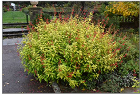
Golden Delicious Pineapple Sage in bloom

Golden Delicious Pineapple Sage is recommended for the following landscape applications;