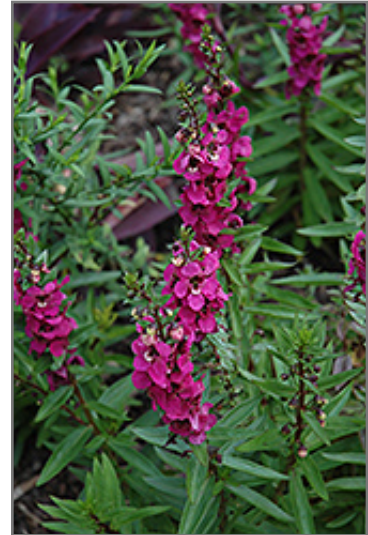
Serenita Raspberry Angelonia flowers

Serenita Raspberry Angelonia is recommended for the following landscape applications;