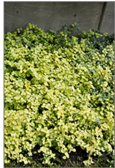
Lemon Licorice Plant