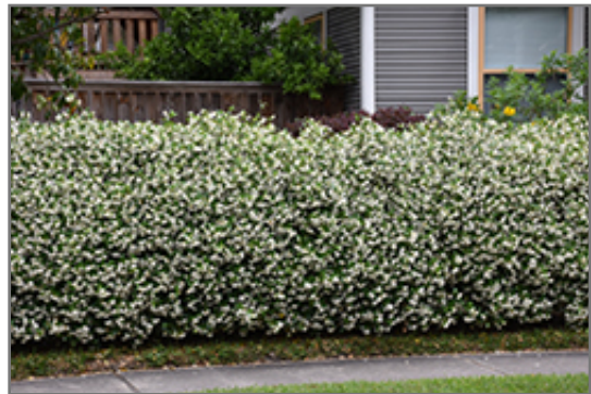
Confederate Star-Jasmine in bloom