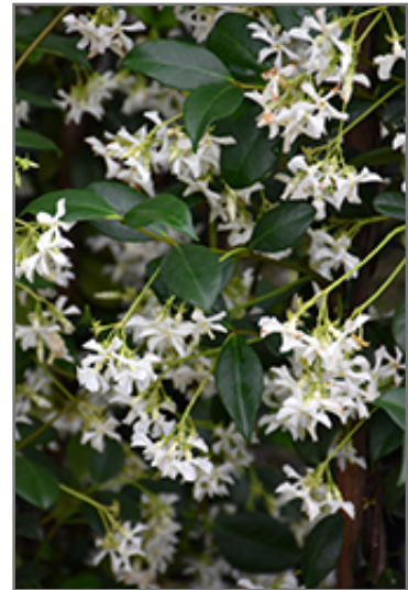
Confederate Star-Jasmine flowers