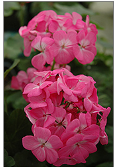
Pillar Pink Geranium flowers