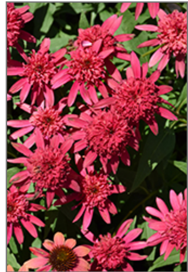
Double Scoop Raspberry Coneflower flowers