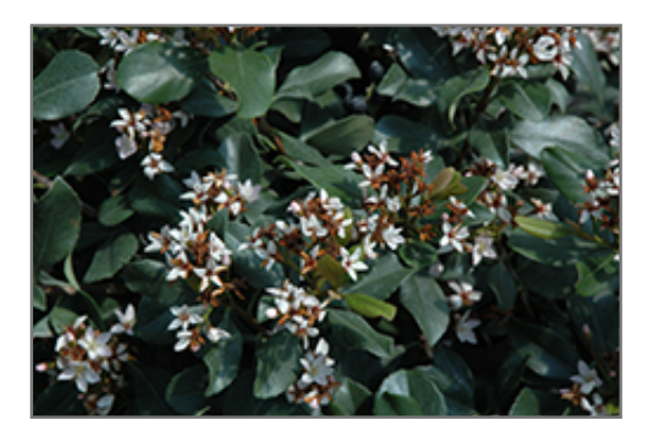
Yeddo Hawthorn flowers

2301 San Joaquin Hills Rd. Corona del Mar, CA 92625 phone: 949.640.5800 www.rogersgardens.com