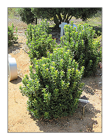
Yeddo Hawthorn