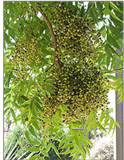
Chinese Pistache fruit

This tree should only be grown in full sunlight. It is very adaptable to both dry and moist growing conditions, but will not tolerate any standing water. It is not particular as to soil type or pH. It is highly tolerant of urban pollution and will even thrive in inner city environments. This species is not originally from North America.