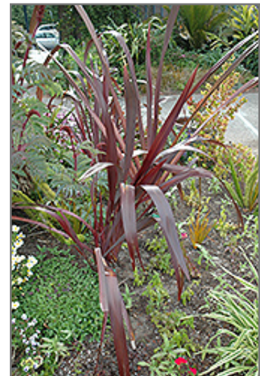
Amazing Red New Zealand Flax foliage