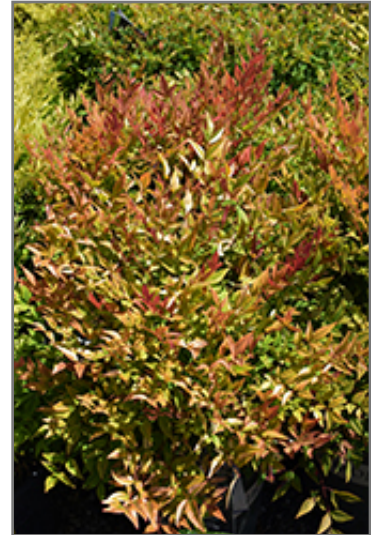
Gulf Stream Dwarf Nandina

Gulf Stream Dwarf Nandina makes a fine choice for the outdoor landscape, but it is also well-suited for use in outdoor pots and containers. Because of its height, it is often used as a 'thriller' in the 'spiller-thriller-filler' container combination; plant it near the center of the pot, surrounded by smaller plants and those that spill over the edges. It is even sizeable enough that it can be grown alone in a suitable container. Note that when grown in a container, it may not perform exactly as indicated on the tag - this is to be expected. Also note that when growing plants in outdoor containers and baskets, they may require more frequent waterings than they would in the yard or garden.