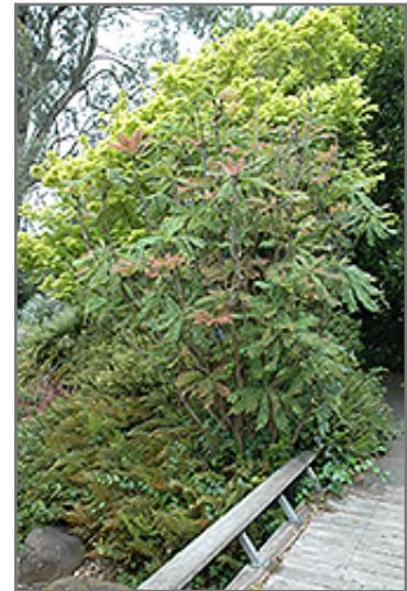
Chinese Mahonia

This shrub does best in partial shade to shade. It does best in average to evenly moist conditions, but will not tolerate standing water. It is not particular as to soil pH, but grows best in rich soils. It is somewhat tolerant of urban pollution, and will benefit from being planted in a relatively sheltered location. Consider applying a thick mulch around the root zone in winter to protect it in exposed locations or colder microclimates. This species is not originally from North America.