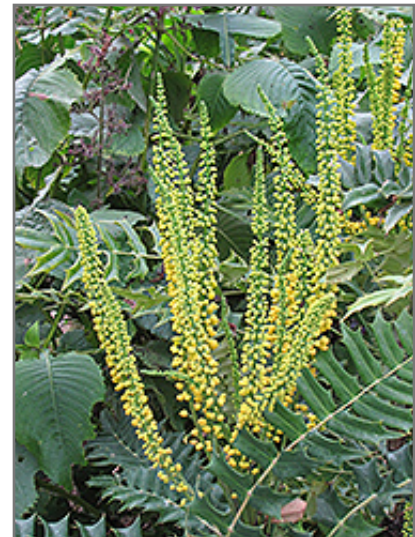
Chinese Mahonia flowers