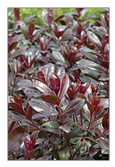
Amy Hebe foliage

This is a relatively low maintenance shrub, and should only be pruned after flowering to avoid removing any of the current season's flowers. It is a good choice for attracting birds, bees and butterflies to your yard. It has no significant negative characteristics.