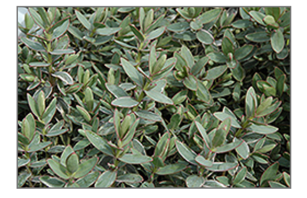
Amy Hebe foliage

Amy Hebe is an open multi-stemmed evergreen shrub with an upright spreading habit of growth. Its average texture blends into the landscape, but can be balanced by one or two finer or coarser trees or shrubs for an effective composition.