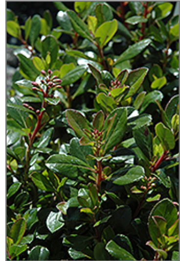
Pink Princess Escallonia foliage

This shrub does best in full sun to partial shade. It does best in average to evenly moist conditions, but will not tolerate standing water. It is not particular as to soil type or pH, and is able to handle environmental salt. It is somewhat tolerant of urban pollution. This particular variety is an interspecific hybrid.