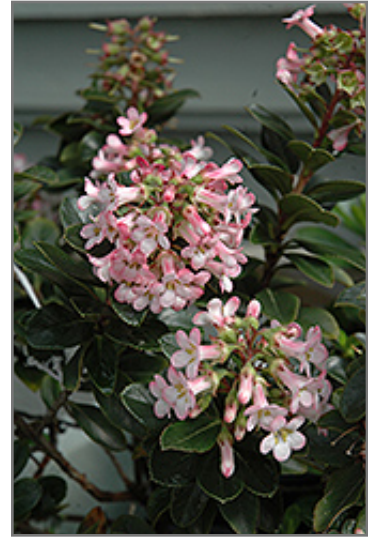
Pink Princess Escallonia flowers

Pink Princess Escallonia is recommended for the following landscape applications;