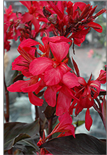
Australia Canna flowers