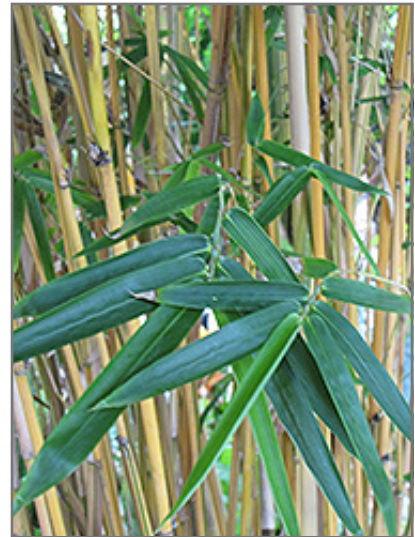
Alphonse Karr Bamboo foliage

Alphonse Karr Bamboo is a fine choice for the garden, but it is also a good selection for planting in outdoor pots and containers. Its large size and upright habit of growth lend it for use as a solitary accent, or in a composition surrounded by smaller plants around the base and those that spill over the edges. It is even sizeable enough that it can be grown alone in a suitable container. Note that when growing plants in outdoor containers and baskets, they may require more frequent waterings than they would in the yard or garden.