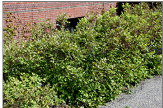
Shrub Yellowroot